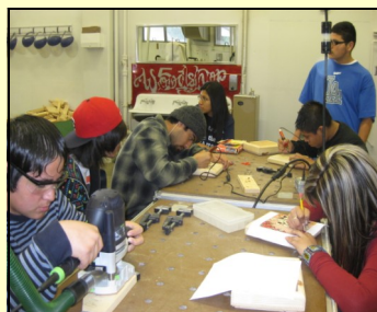
Woodworking Cabinet Building