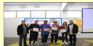
Filmmaking Award Ceremonies